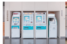
Self-service terminal integration