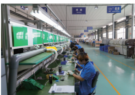
Electronics assembly lines