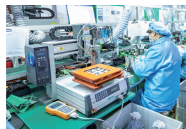
Test bench integration