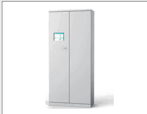
Smart Cabinet Application